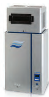
Condair US Ultrasonic in-room humidifier Very low energy cool mist humidifier with fan unit.