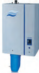
Condair RS Resistive humidifier Innovative scale management and no disposable boiling cylinders.