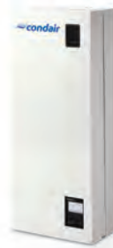
Condair CP3 Mini Low capacity electrode humidifier Up to 4kg/h of steam direct to a room or to an AHU.