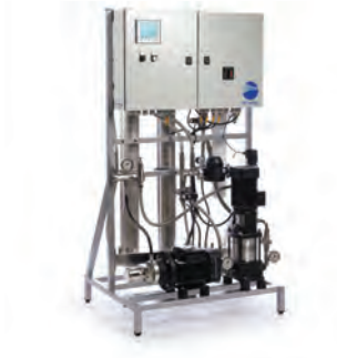
Condair HP High pressure in-duct humidifier Spray humidifier delivering humidification and evaporative cooling to multiple AHUs.