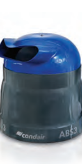
Condair ABS3 Rotary Disk Atomizer Economic cool mist system ideal for production and agricultural areas.