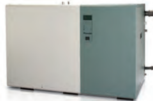
Condair SE Steam-to-steam humidifier Uses a building's impure steam supply to create pure humidifying steam.