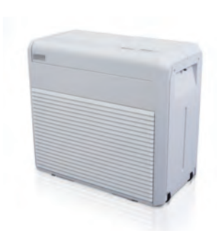
Defensor PH Mobile evaporative humidifier Suitable for areas up to 900m 3 and can be plumbed-in or fed via a water tank.