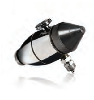
Condair JetSpray Compressed air and water spray humidifier Direct room spray humidifier with rapid evaporation and highly directional aerosols.