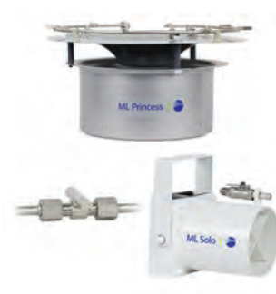
ML System High pressure in-room humidifier Water treatment and pressurisation plant with a selection of direct air nozzle systems.