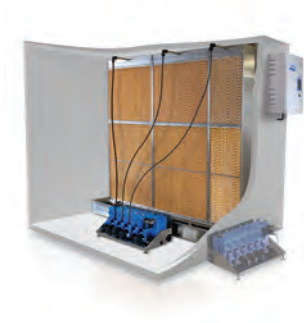
Condair ME Evaporative in-duct humidifier Provides low energy humidification and evaporative cooling.