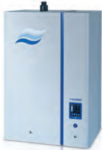
Condair EL Electrode boiler humidifier Reliable steam humidification that is easy to install, use and service.