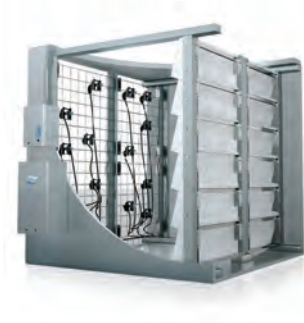
Condair DL Hybrid in-duct humidifier Close control, spray and evaporative humidifier.