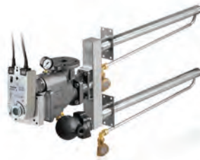
Condair ESCO Live steam humidifier Uses a building's existing hygienic steam supply.