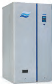
Condair GS Gas-fired humidifier Steam humidification with the operating economy of gas.