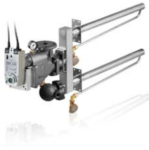
Condair ESCO Live steam humidifier Uses a building's existing steam supply, offering 5-2,000kg/h.