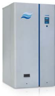
Condair GS Gas-fired humidifier Steam humidification with the operating economy of gas, offering 20-270kg/h.