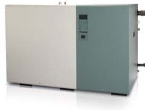
Condair SE Steam-to-steam humidifier Uses a building's impure steam supply to create pure steam, offering 23-475kg/h.