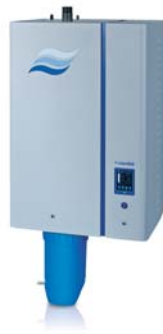
Condair RS Resistive humidifier No disposable cylinders, offering 5-160kg/h and \pm 5\% RH control or \pm 2\% with RO water.