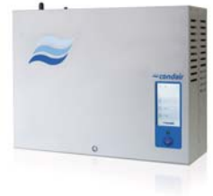
Condair RM Low capacity resistive humidifier Offers 2-8kg/h of steam for in-duct humidification.