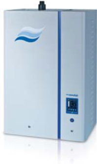
Condair EL Electrode boiler humidifier Easy to install and service, offering 5-160kg/h and \pm 5 to \pm 10\% RH control.